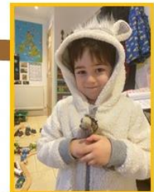
A warm welcome from a very friendly sheep!