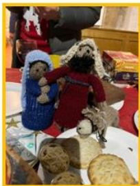
Mmmm..mince pies at the Carols by Candlelight!