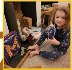
The donkey made a bee-line for the Advent calendar...