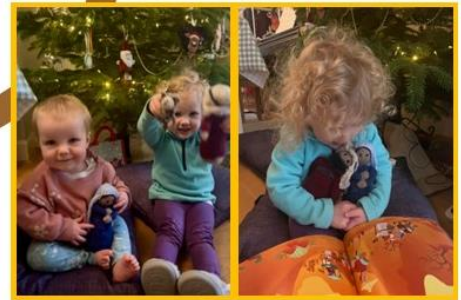
Sharing stories by the tree