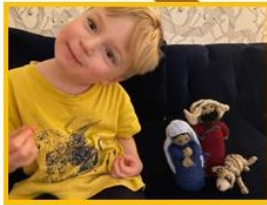
Enjoying some Christmas TV