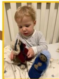
Chatting with a new friend