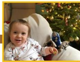
Being treated to some juicy grapes to keep us going