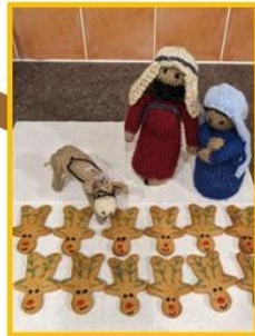
Not wishing to criticise Revd Karen's gingerbread biscuits, but these are strange-looking donkeys!