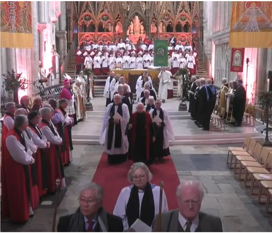
2:54:37 The service ends