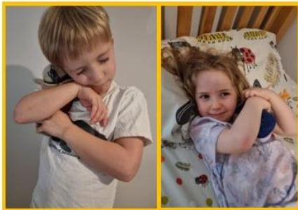
Feeling the love!