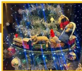
Trying out a new form of transport – much less bumpy than a donkey!