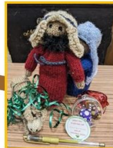
The donkey tried making a decoration at the Little Wrigglers Christmas party