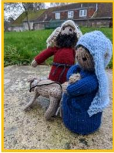
Off we go!

St Bartholomew's Posada 2023: thank you to everyone who hosted Mary, Joseph and the donkey on their long journey. Here's a glimpse of what they got up to along the way!