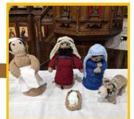
We made it to Bethlehem – and the baby Jesus was born!