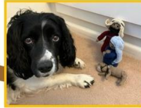
In the next house we met a gentle giant!