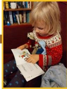
First stop – hearing a story about a donkey called Eeyore