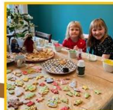
Future Bake Off winners!