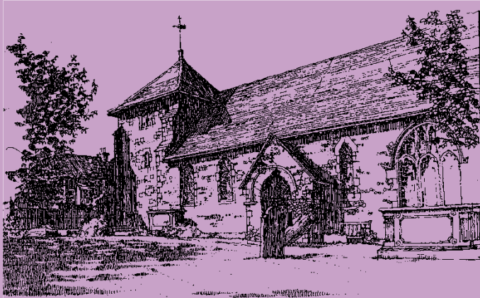
St Bartholomew, Hyde